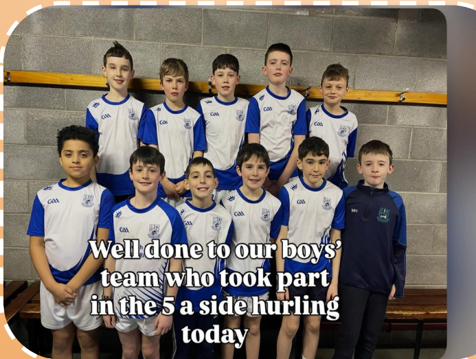
Well done to our boys' team who took part in the 5 a side hurling today